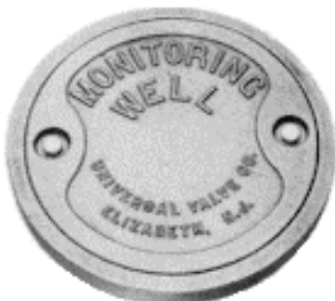
Universal #65 Lid